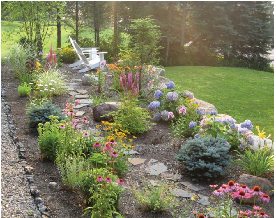
An example of a rain garden constructed and planted in the Lake George watershed.

When rain falls, it needs to infiltrate into the ground, recharging the groundwater and